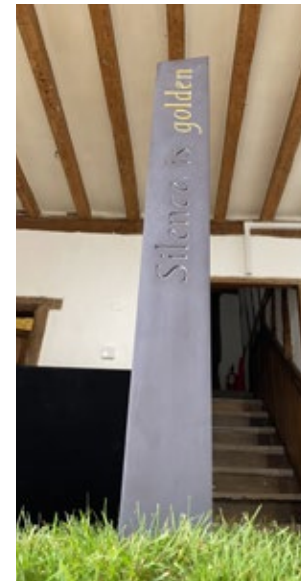
Silence is Golden Purple Plum slate, 23 carat gold leaf 87 x 8.5 x 4.3 cm