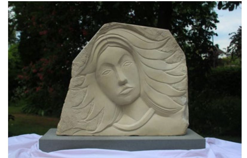
Aurore 51 x 55 x 20 cm French Caen limestone on a Forest of Dean limestone base