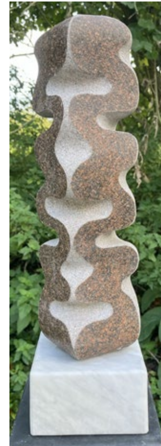
Stacked 53 x 15 x 15 cm Orissa Granite on Marble base

Mark Stonestreet's sculptures are a playful investigation into line, definition and geometry. Working with negative space, light and shadow, Mark gives each of his sculptures direction and flow. Lines direct the form, textures are contrasted and complemented, and shapes are contorted into new, enticing arrangements. Yet each design maintains a sense of Mark's own, free hand carving, allowing his works to develop in an open and instinctive manner.