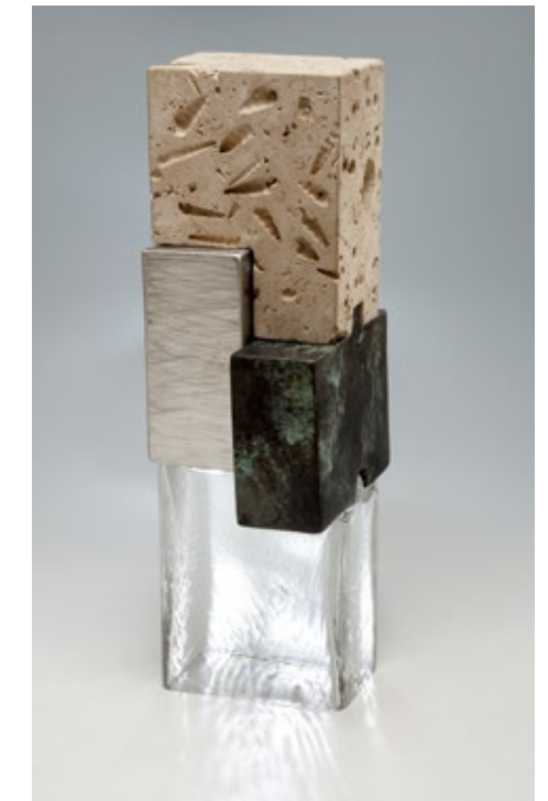
Four Rectangles 59 x 18 x 24 cm Stone Bronze Glass Steel