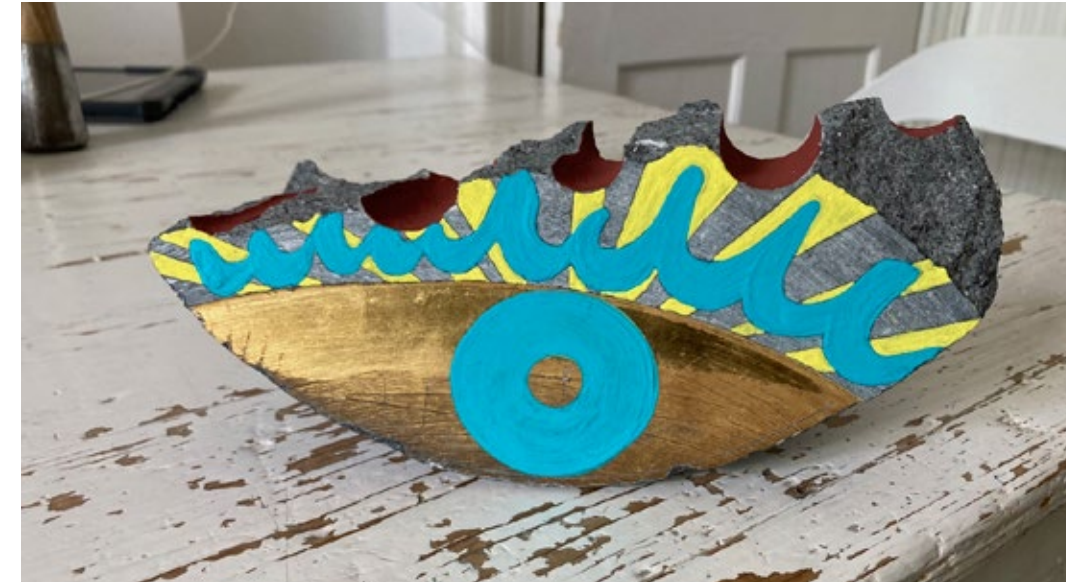
Eye 10 x 20 x 6 cm Kilkenny limestone with 24 carat gold leaf and mineral paint