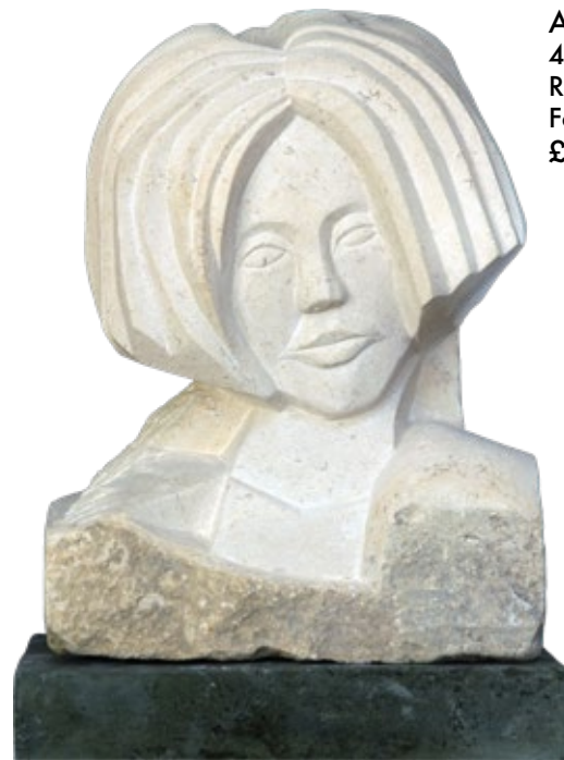
Anais 43 x 32 x 24 cm Reclaimed limestone on Forest of Dean Limestone base £2,800

He has exhibited sculptures in the UK and with the Oxford Sculptors Group and the Cotswold Sculptors Association.