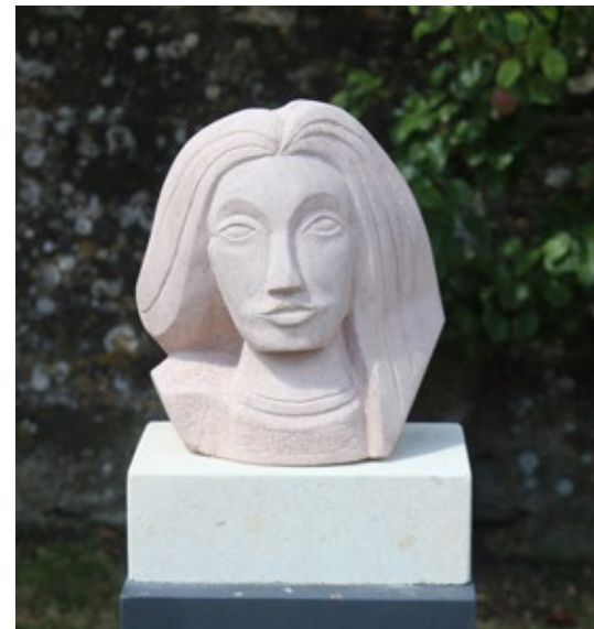
Arusha 42 x 30 x 21 cm Red Ancaster Marl limestone on a Bath limestone base