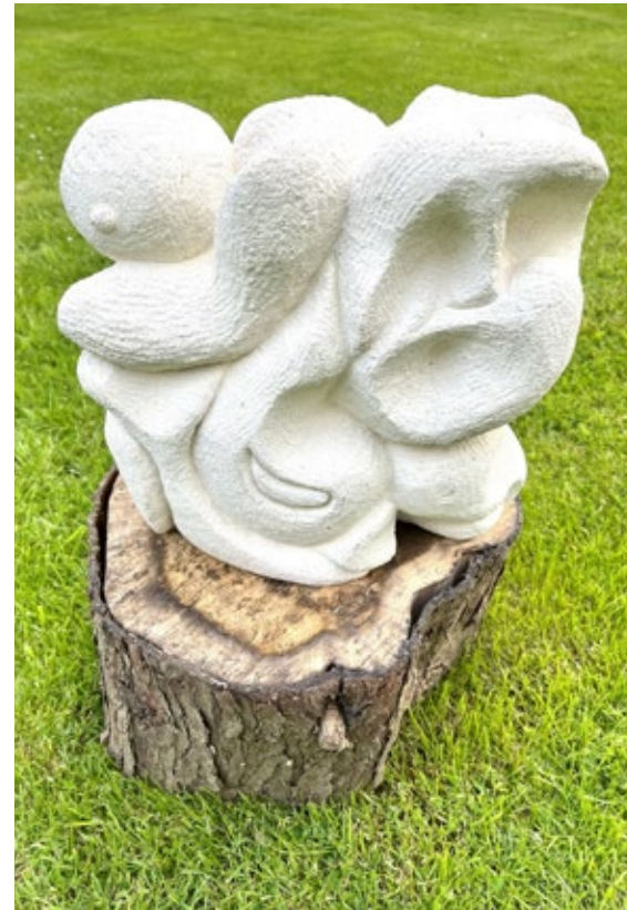
Resting 30 x 30 x 15 cm Bath Stone on pine tree-stump