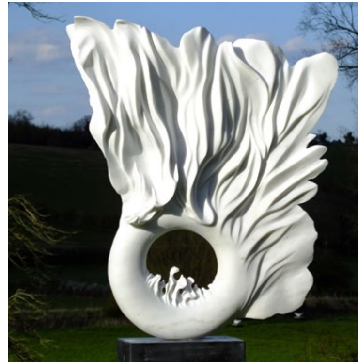
Cerchio di Fiamme I 78x 67 x 17 cm Statuary Carrara marble