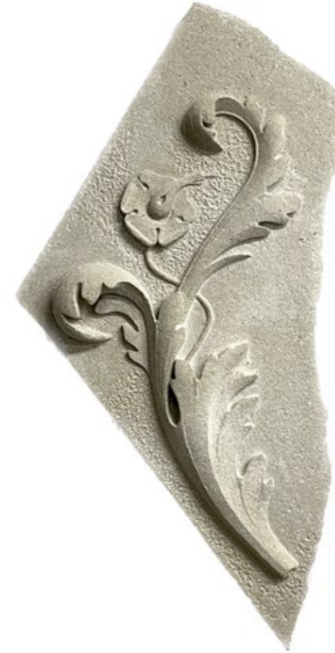
Scrolling Acanthus 50 x 30 x 3 cm Portland Stone