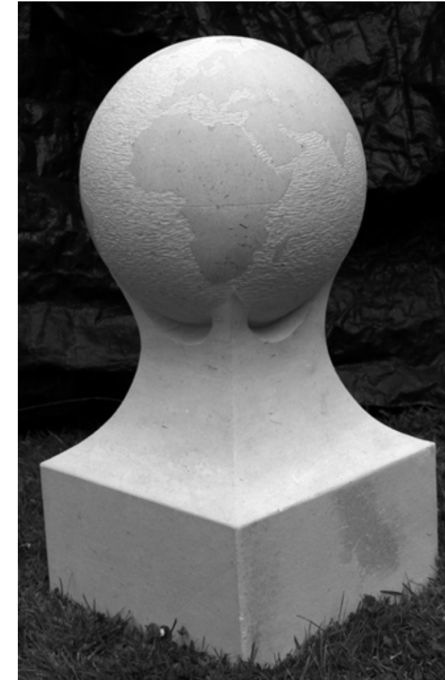
Atlas 53 x 25 x 25 cm Portland limestone