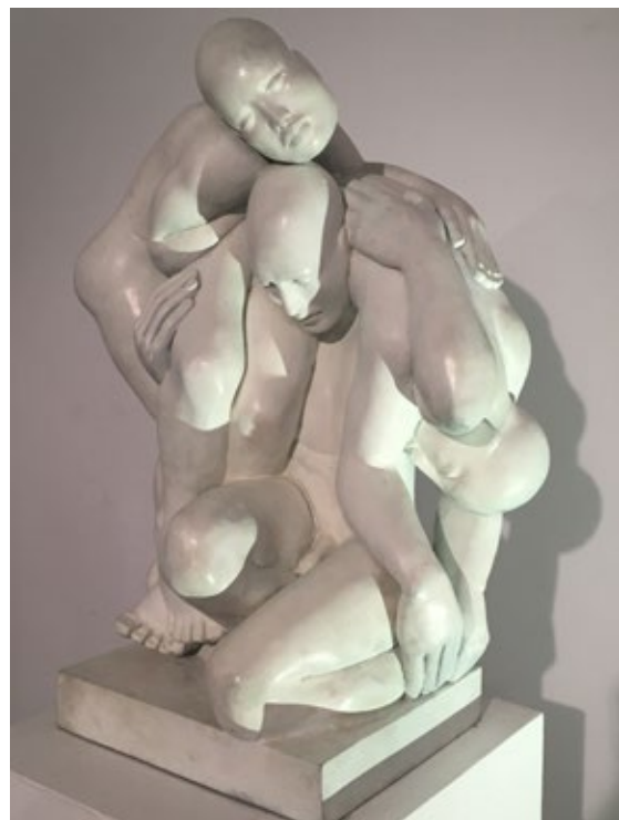
Embrace 60 x 35 x 35 cm Patinated Bronze ed 1/9

Her figurative pieces show a sensitivity and understanding of human forms and emotions.