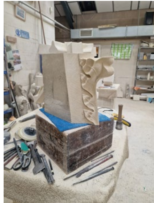
Gloucester Crockett Study 30 x 15.2 x 24.5 cm