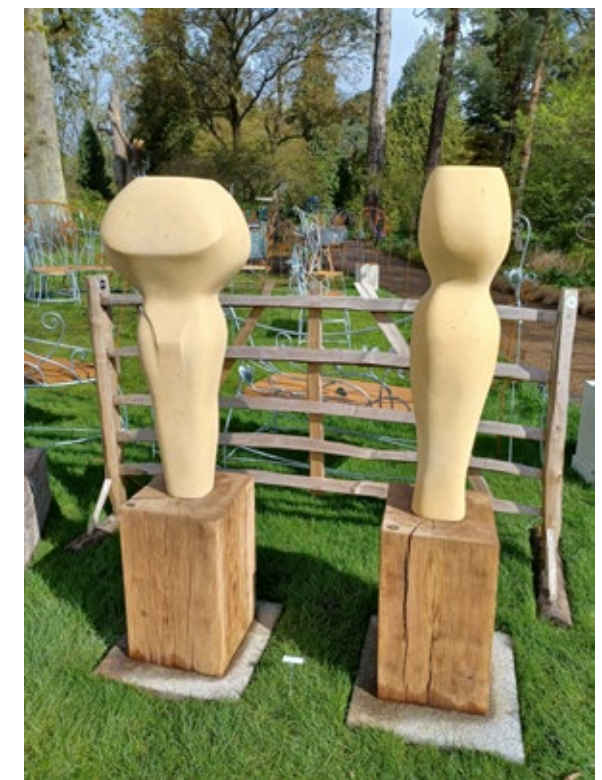
Together We Stand Maltese limestone on granite top plate and oak plinth 150 x 30 x 30 cm