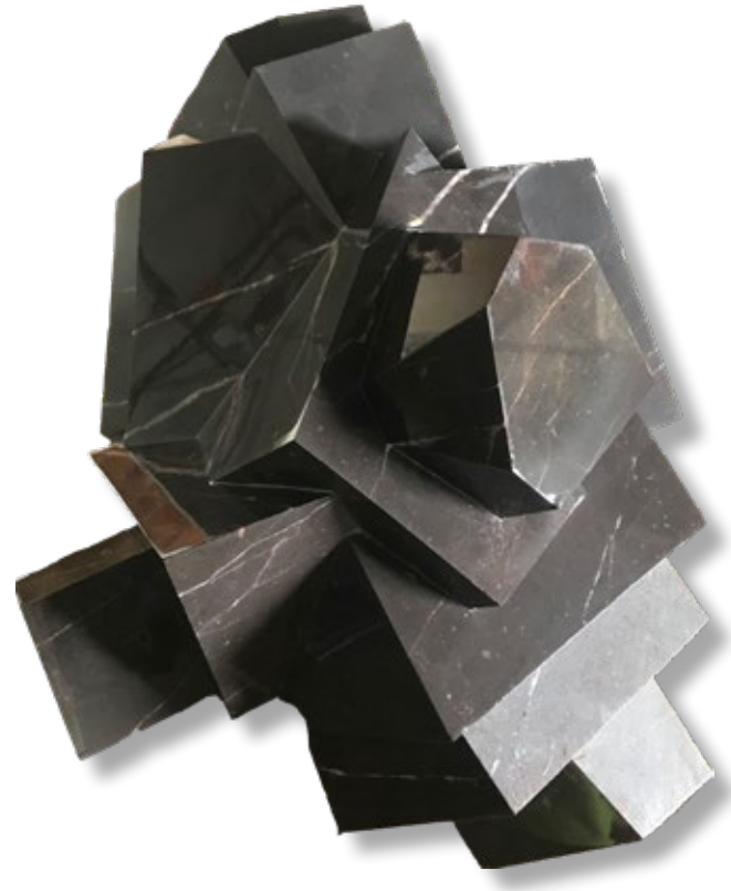
Object 50 x 60 x 40 cm UK Carboniferous limestone

Based in Devon, Archie works on larger scale stones. He enjoys finding and using local stones that interest him.