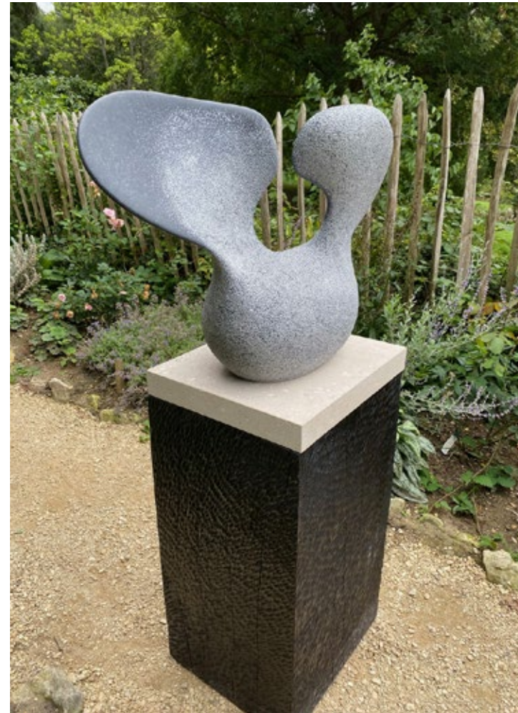
Baetylus 60cm x 45cm x 23cm, Kilkenny Limestone, Oak plinth

The intention is to recall some past primeval state while playing with the ambiguity and form of the artefact. The work invites the viewer to multiple readings, where the mystery is in their elusiveness.