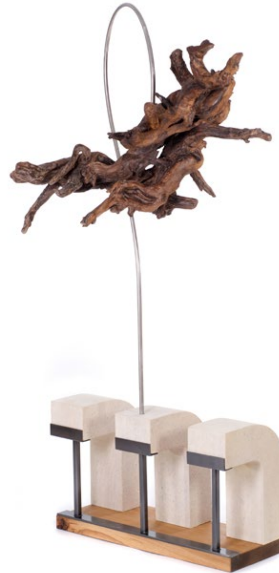
River Cess driftwood, Minervois France Clipsham (Rutland) limestone. 180cm x 80cm