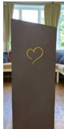
Wild at Heart Purple plum slate, 23 carat gold leaf 87 x 8.5 x 4.3 cm

He thrives on the end result and meeting the criteria set by the customer often resulting in raising the expectations with the image on paper becoming an actual portrayal of work carved into any piece of stone. He feels that a memory needs to last a lifetime and since his work often arises from personal recommendations, he continues to aim for nothing but perfection.