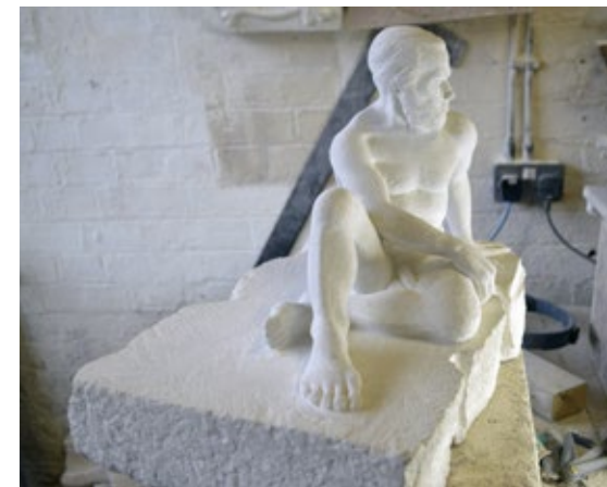
Male Nude Portland Limestone 30 x 40 x 26 cm