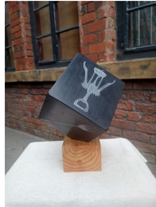
Canteen 15 x 15 x 15 cm Relief carved Welsh slate cube