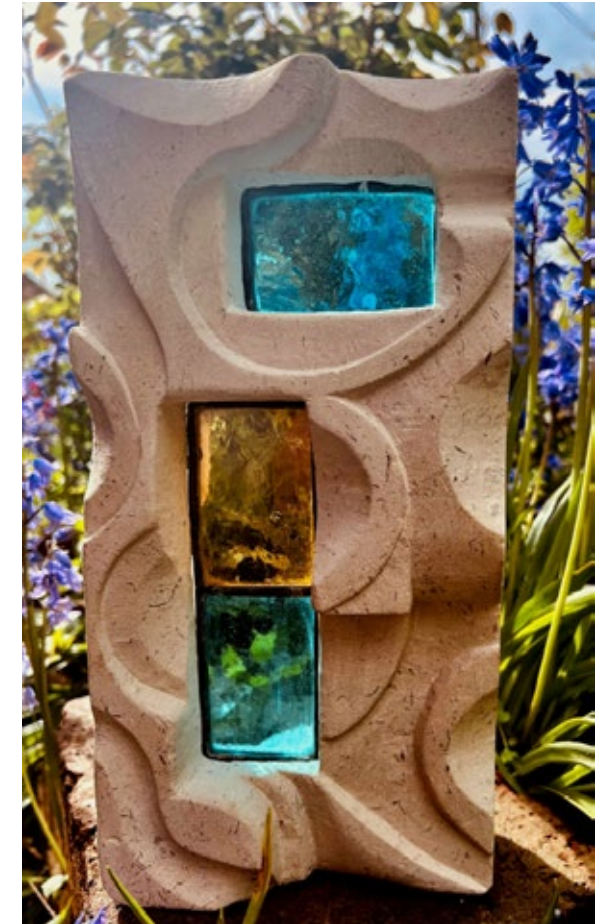
Stained glass and abstract stone 30 x 18 x 7 cm Ancaster stone, vintage stained glass